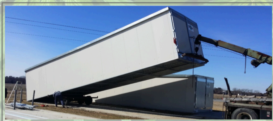
HEAVY DUTY FRAME - LIFTABLE STRUCTURE