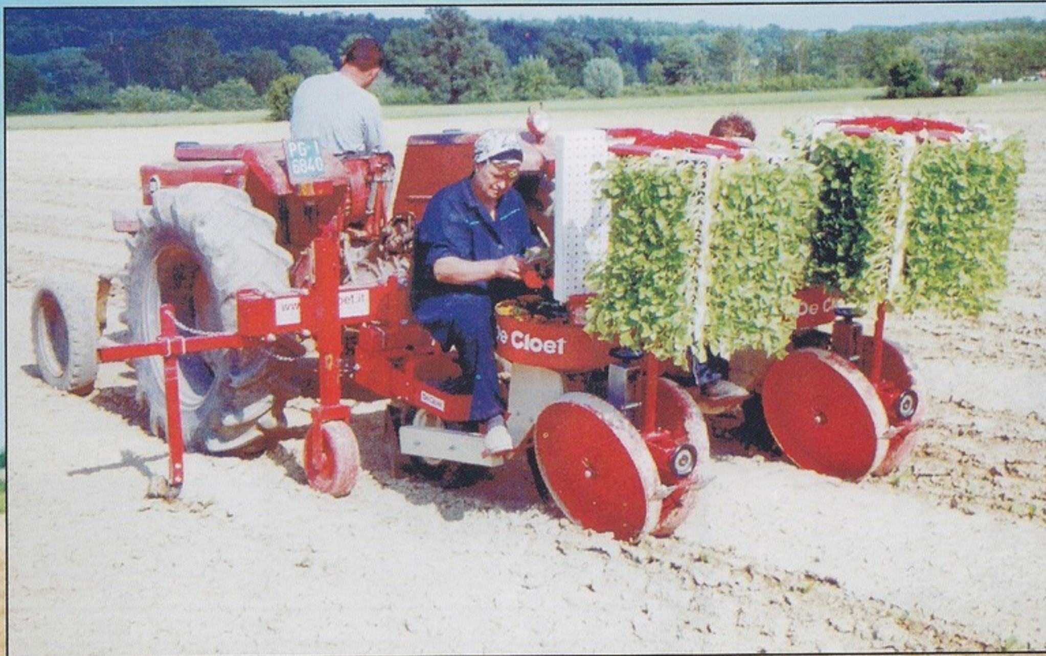
TCD 2 rows