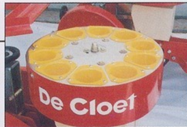
Distributor with 10 holes