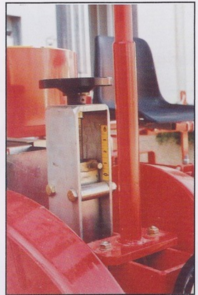
Vertical and orizzontal adjustment of the wheels that compress the ground.