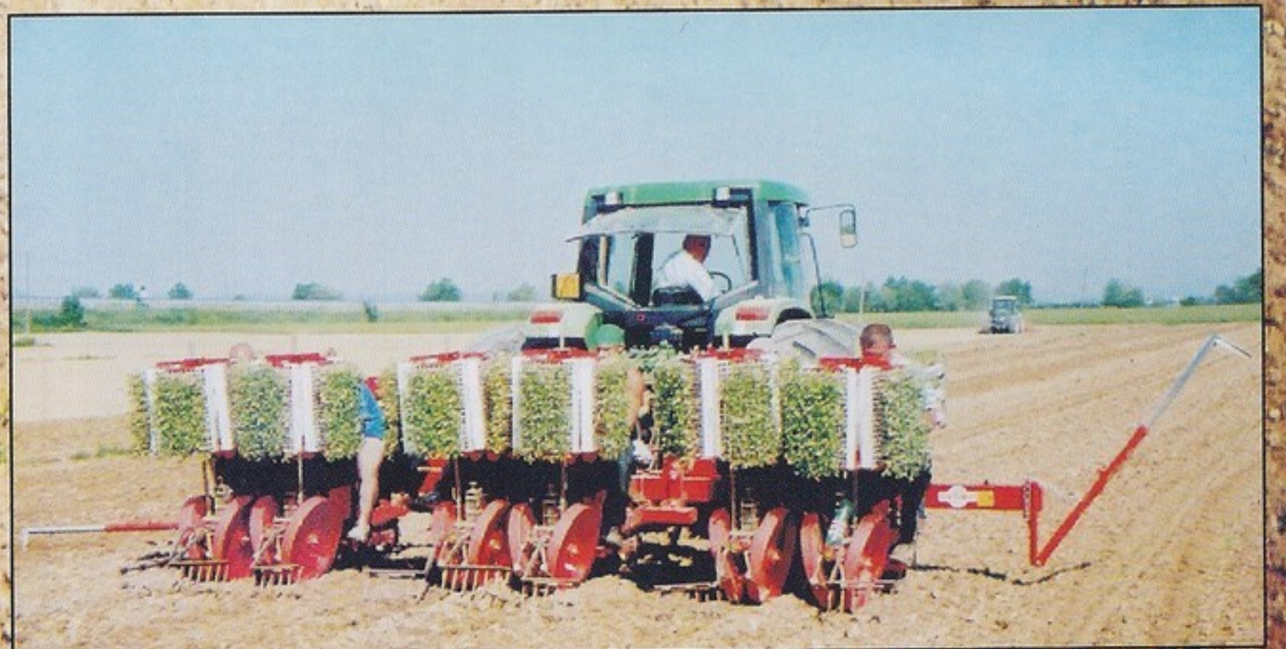
TCD 6 rows