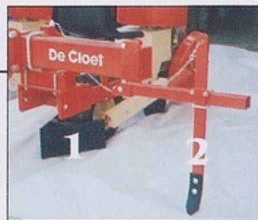
1. Clods divider 2. Rows liner