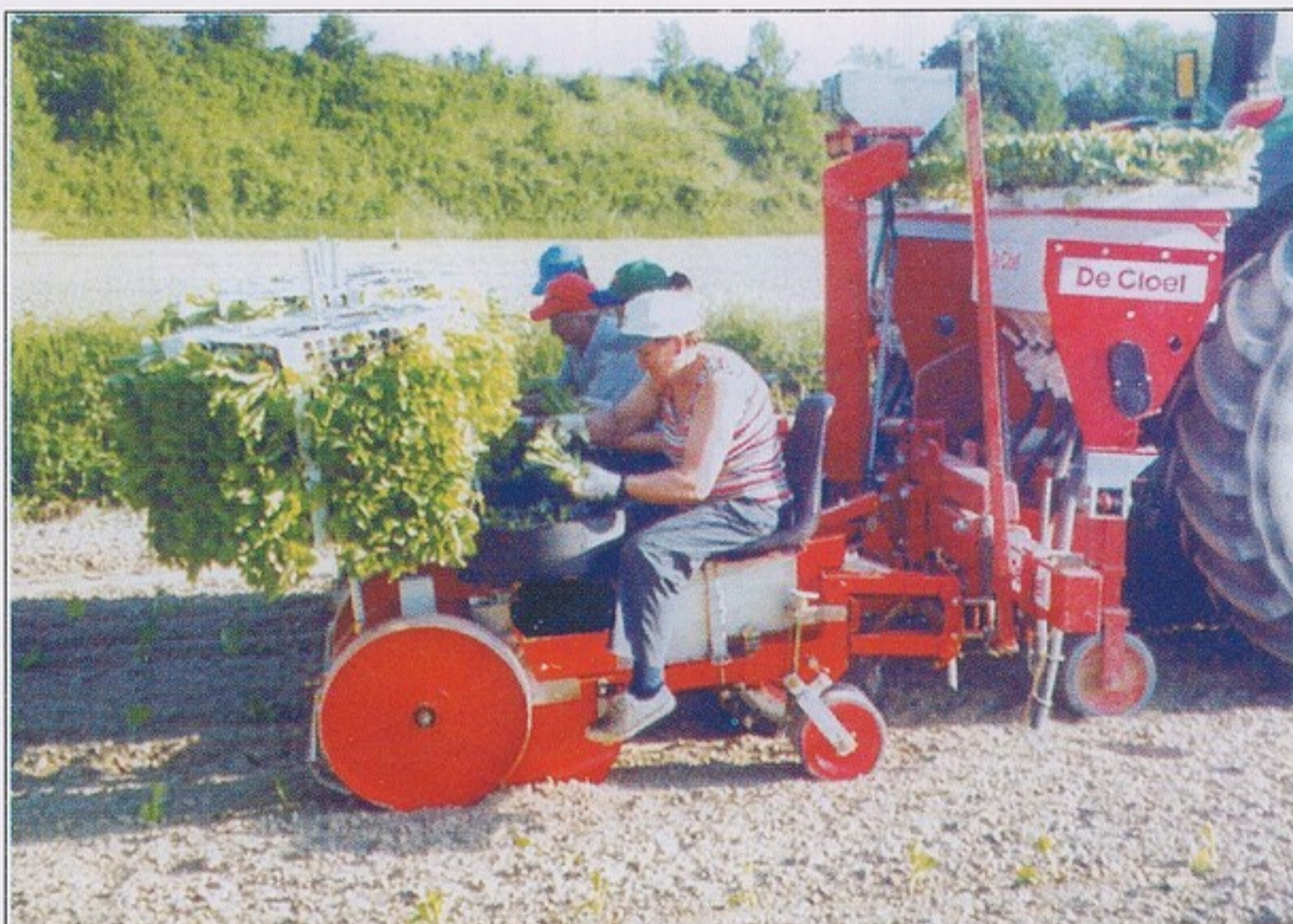
TCD 4 rows