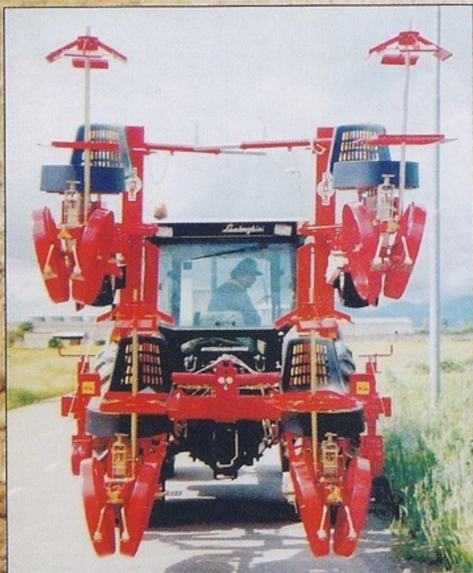
TCD 4 rows transport position